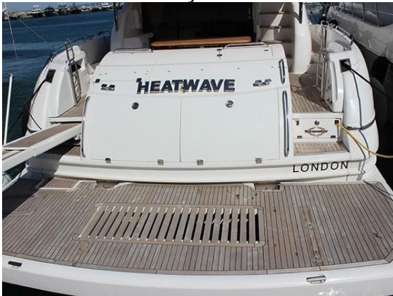
Sunseeker Manhattan 74