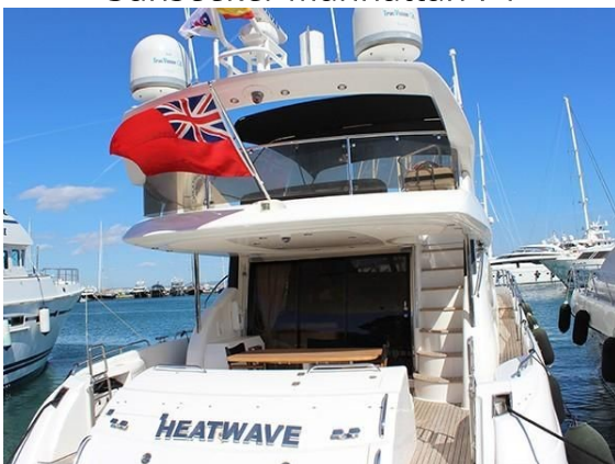
Sunseeker Manhattan 74