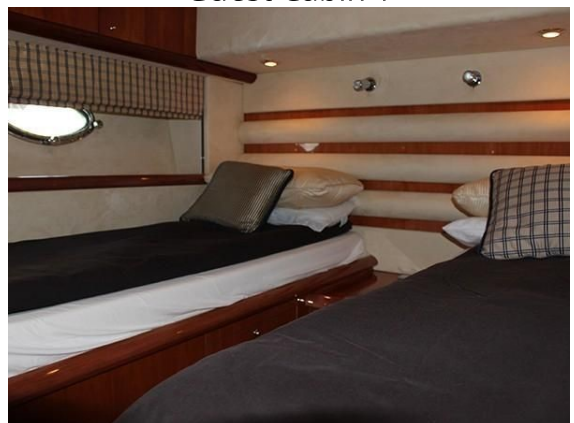
Guest Cabin 1