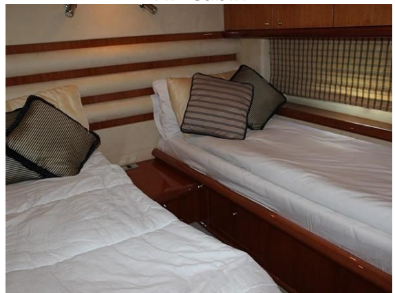
Guest Cabin 1