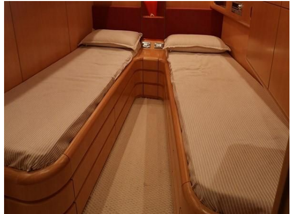
Twin Guest Cabin